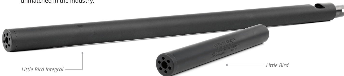
Little Bird Integral

Originating from the need to easily adjust baffle spacing for product testing, the Little Bird's patent pending design has proven very effective. The threaded interior allows baffles to be adjusted for tuning and self-cleaning; a unique feature unmatched in the industry.